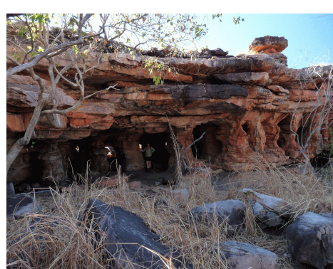
Honeycomb caves near Bachsten. Imagine