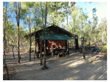
Hut at Bachsten camp