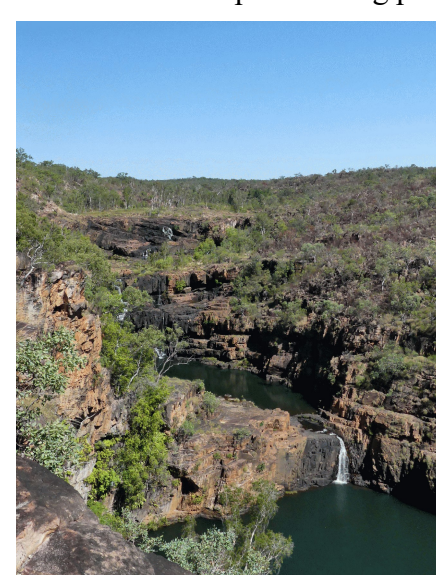
Bachsten Falls in the Dry. Imagine what it would look like in the Wet.

There is a helicopter landing pad at Bachsten Camp. We've