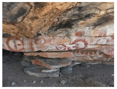
Art site near Bachsten camp

Walking along the Charnley River in July 2018, I couldn't help but marvel at the flood debris 10-15 metres above the water level at that time. I couldn't help but wonder what it would be like in flood.