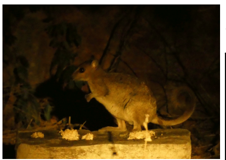
Monjon. Spotlighting at Bachsten.

The best helicopter we can get comes from Derby. To get to Derby, you can fly to Broome and catch a bus. Or I might join this trip up with another and offer a free ride to and/or from Darwin. The helicopter takes five passengers plus packs. If we get more than five, we'll fly some in to a nearby airstrip by fixed wing aircraft and do a shuttle from there. Unless we get more than ten including the guide, everyone will get the flight between Bachsten and Derby.