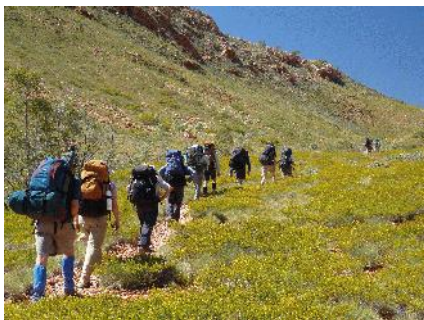
Walking into Ormiston Pound

The shorter version is a must. We follow a marked track into Ormiston Pound, set up camp near a waterhole and walk without packs to Bowman's Gap where we find one of the largest permanent waterholes in the Centre.