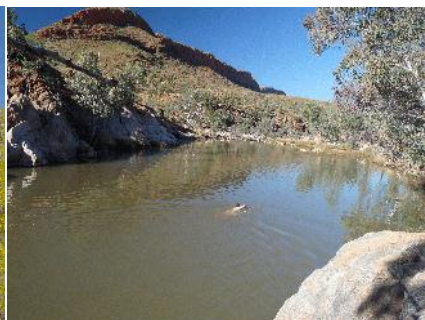
Having a swim at Bowman's Gap