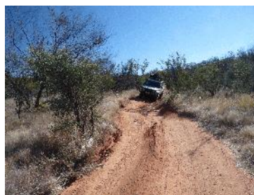
Birthday Waterhole track, note the angle of the vehicle.

The 4WD tracks into Birthday Waterhole and Hugh gorge are among the roughest in the West Macdonnells, so rough that we had to change one of our West Macdonnells walks when we could no longer get reasonably priced local transport. This time we will have our own vehicle – or vehicles.