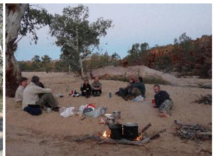
Ormiston Pound campsite

With so much water, it is unlikely that we'll be able to walk back through Ormiston Gorge so it is likely to be in and out the same way. Worth noting that in 2010, some chose to float their packs through rather than do the extra walk. The water will be cold but not as cold as it was then.