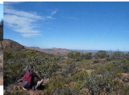
View from a high point near Brinkley.

Hugh Gorge is one of the most spectacular gorges in the ranges. I don't have a digital photo to include so I hope to be able to drive to near the gorge, set up camp and do a long day walk through, perhaps looping back through a different gorge.