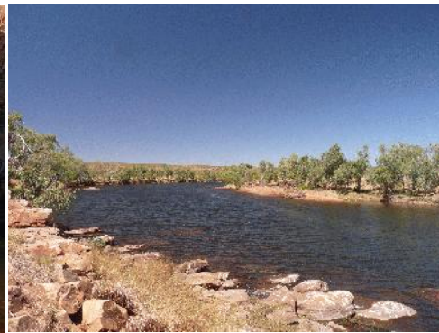
Old Policeman's Waterhole, Davenport Range National Park, Sep 2011

2011 – good but not anywhere near as wet as this year.