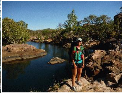
Waterfall Creek pool