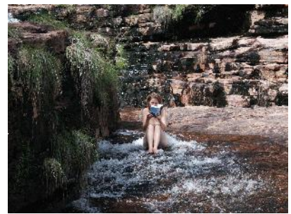
Motorcar, relaxing at lunch

The photos here should give you something of an idea as to what to expect.