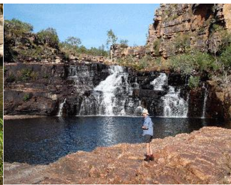
Getting ready for a swim at Amphitheatre Falls.