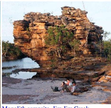
Monolith campsite, Jim Jim Creek