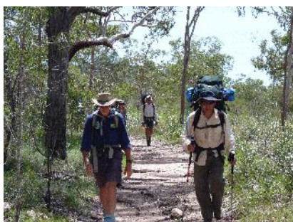
On the marked trail. This is as easy as it gets.

This walk begins with a three km stroll along a marked track followed by another three km to our campsite above. From there we spend a day exploring the wonderful sandstone formations that surround us and, of course, enjoying some of the pools we find along the way.