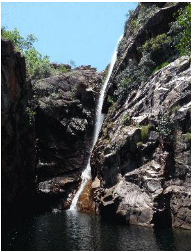
Motorcar Falls, late dry season

We begin with the Yurmikmik walk to Motorcar Falls. For information see the Kakadu Yurmikmik notes, www.parksaustralia.gov.au/kakadu/pub/yurmikmik.pdf – that's the easy part. After a swim, we leave the track and do a steep climb up above the falls. That's the hard part. After a visit to the top of the falls, we move upstream to a campsite and spend the rest of the afternoon relaxing by the pool. The next day, we do a loop walk through some amazing sandstone country with plenty of time for swim stops along the way. On the final day, it's back the way we came.