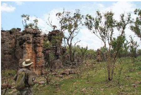
Rock formations, upper Motorcar