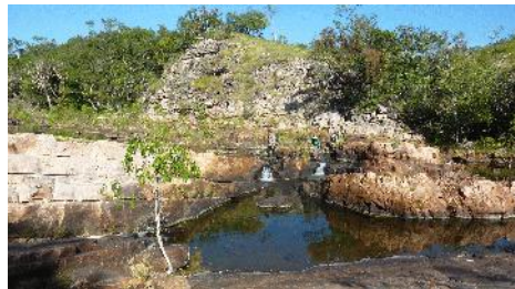
Approaching camp from upstream