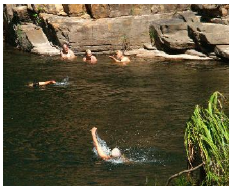
Twin Falls Creek, your own private pool

As with Jim Jim, we begin with the marked trail to the top of the falls. After a look around the top of the falls, we walk about two km upstream and set up our camp. We spend the next day exploring the upper gorge as far as the Amphitheatre Falls. We return to our vehicle the way we came.