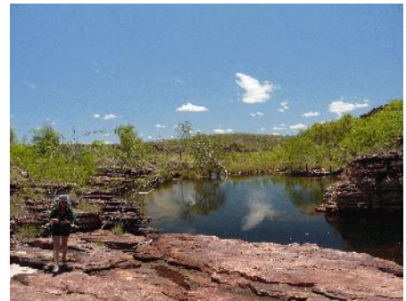
One of the many pools on the day walk