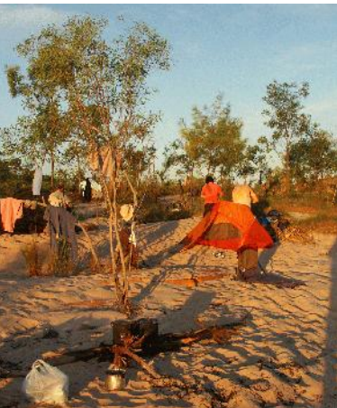
Sandy camp near Jim Jim

This is one of our more strenuous options. It begins with the Barrk Marlam walk to the top of Jim Jim Falls. Here we have two choices, a walk of about 6 km (each way) to the Jim Jim Monoliths or a shorter walk to the top of Anbadgoran, the rainforest gorge. We return the way we came.