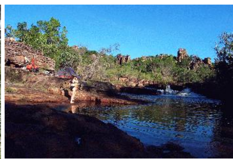
Campsite and pool.