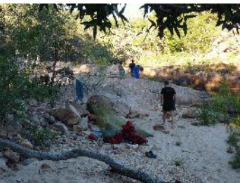
Barramundi camp & pool

We begin our walk from the Maguk car park. Before we get to the main pool, we turn off and climb up. A short walk brings us to the top of the falls. Another two km brings us to a sandy campsite by a nice pool. We spend a full day exploring our immediate surrounds before returning the way we came.