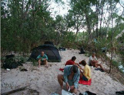
Waterfall Creek camp & pool

We begin with the walk to the top of Gunlom in southern Kakadu. For information see the Kakadu Gunlom notes, www.parksaustralia.gov.au/kakadu/pub/gunlom.pdf . A walk of only 1 km brings us to the top of the falls. A further 2 km along relatively flat ground brings us to a nice pool, our home for the next two nights. Our day walk is only another two or three km upstream to the edge of the rocky area. There are plenty of pools, a few art sites and some great views for those energetic enough to climb to a high point.