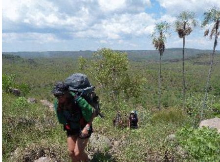
Motorcar, climbing to the top