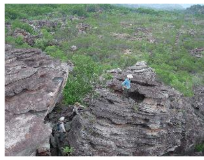
Climbing to a high point for a view.

By now you should have a good idea of the possibilities. As stated at the beginning, exactly where we go will be determined by the weather conditions at the time, which walks are still available at the time we put in our permit application and on the fitness and interests of the group.