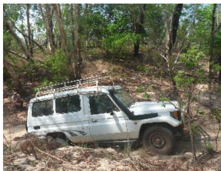
On the track to Graveside

Of all our possible walks, this is the one with the longest, roughest drive. It also has one of the longest walks in and out. The reward is a chance to explore both branches of one of the most beautiful gorges in Kakadu.