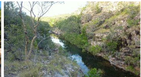
Walking back to the vehicle