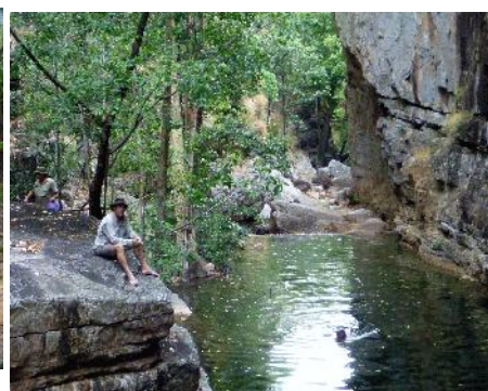
Relaxing at a pool in the side gorge