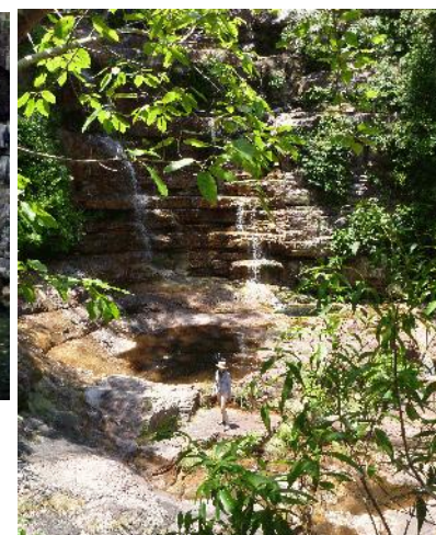
Waterfall in the main gorge.