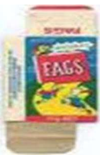
78 RPM records!