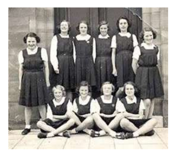
Nearly everyone's Mum was home when the kids got home from school