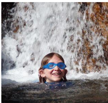
For most children, the pools are paradise.

During the next six days, we visit magical spots our clients have christened the Emerald Pool, Piccaninny Pools and the Buff Pool. Our route takes us along creeks, up a steep hill, across a plateau, down to another pool and back via the main creek. There are many possible campsites so we can make our decision according to how fast the group is going and how they feel at the time.