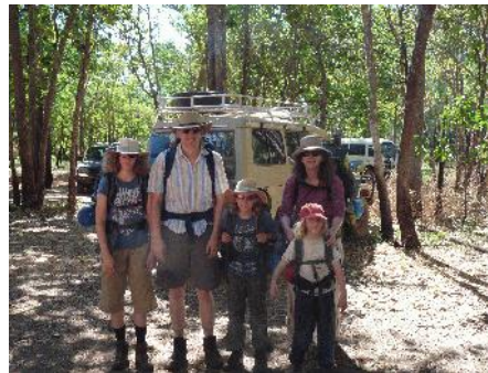
Setting off. We won't see the vehicle again for a week.

From the parking area, a relatively easy three kilometre walk brings us first to some pools, then up a hill for some good views, through a patch of forest and finally back down to the creek and our first campsite near a pool, perfect for swimming as are most of the pools we encounter.