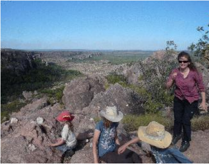
At the highest point on the walk.

If we move reasonably quickly, we have the option of doing some of the walking without packs or, alternatively, doing a side loop up to one of the best high view points in the park, then down to an amazing swim-through cave and some Aboriginal art sites. As the photos show, we have had young children who were easily able to do this option.