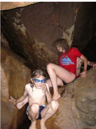
In the cave.

The first part of the optional side loop is more difficult and would rate as level 4. It includes a steep climb up and an equally steep climb down. The decision as to whether or not to do this will be made during the trip when the group can see how they are all going. Those who do it usually consider the swim-through cave to be one of the highlights of the trip.