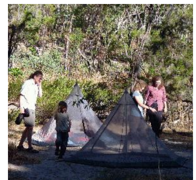
Setting up camp. It's hard to go any lighter than this.

During the next six days, we visit magical spots our clients have christened the Emerald Pool, Piccaninny Pools and the Buff Pool. Our route takes us along creeks, up a steep hill, across a plateau, down to another pool and back via the main creek. There are many possible campsites so we can make our decision according to how fast the group is going and how they feel at the time.