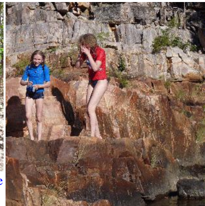
At the first camp and loving it.