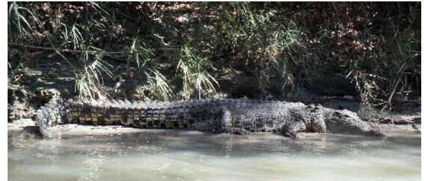
One of the many crocs we saw on a cruise we did in August 2015.

Kakadu is famous for its crocodiles and its Aboriginal culture. The best way to include these in a short trip like this is the Gulyambi Cruise on the East Alligator River so that you can get a good appreciation of the local people and their culture. The cruise takes about 1¾ hours. The drive from