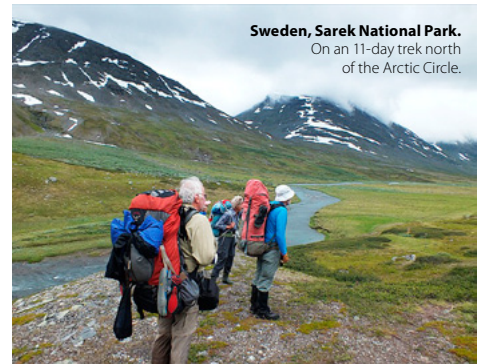
Sweden, Sarek National Park. On an 11-day trek north of the Arctic Circle.