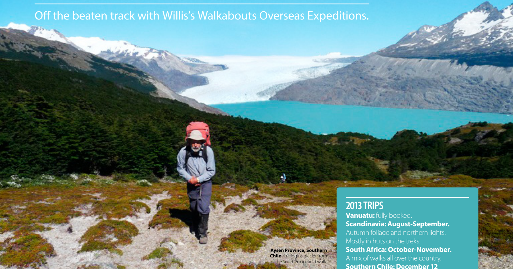
Aysen Province, Southern Chile. O'Higgins glacier from the Southern icefield walk.

Off the beaten track with Willis's Walkabouts Overseas Expeditions.