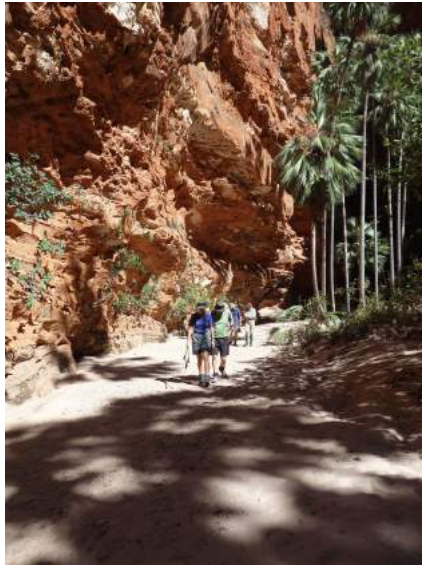
Getting into this beautiful little gorge requires a steep scramble up a dry creek bed.

We cannot climb to the actual top as climbing up the domes themselves is not permitted because of their exceptionally fragile nature. We can, however, follow watercourses as far as they will take us ... and that gets us some amazing views.