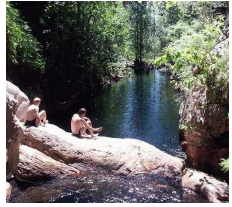
Osmond pool and cascade