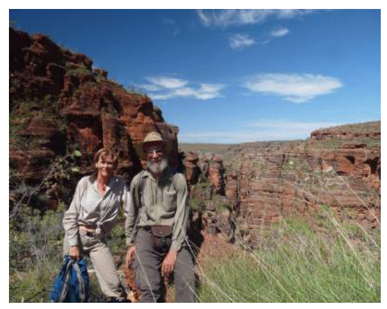
Looking down Piccaninny Gorge from near the top.

In mid 2003, Purnululu joined the list of Australia's World Heritage locations. Here's what the Department of Environment and Heritage has to say. "Famous for the 45 000 hectare Bungle Bungle Range, with its huge expanse of striking banded beehive structures, sandstone cliffs and towers, Purnululu has been listed as an outstanding landscape that is a superlative natural phenomenon, revealing the history of its formation over hundreds of millions of years. Purnululu National Park has such outstanding universal natural values that it enriches the world and should be conserved for the benefit of all people. Before 1982, when aerial pictures were first released, it was virtually unknown except to pastoralists, scientists and the local Aboriginal community. It is now seen as one of the scenic jewels of outback Australia."