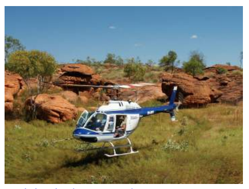
Arriving in the Osmonds

The vegetation can change dramatically from year to year, so dramatically that the guide on one could scarcely recognise the areas that were described in our notes from three years earlier. It's been the same on each trip since. The one constant is the lovely gorges, pools and waterfalls which make the Osmonds a special place. At the end of the ten days, a helicopter picks us up