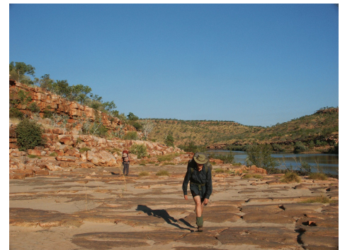
Easy walking along the Durack

On day 3 or 4 we should reach Nyia Creek, a smaller version of the Durack itself. Having now done some exploration, we may be able to add a bit more time here. We didn't check many places but we did find the largest single Aboriginal art site any of us had ever seen – a 250 m rock wall covered in paintings, some very faded, some as clear as if they'd been done yesterday. In 2008, we discovered a magic spot – a large pool below a small flowing cascade. Our next two trips showed that this was a wonderful area, worthy on more exploration. The flat rock ledges will make a perfect camp for two nights as we continue our explorations.