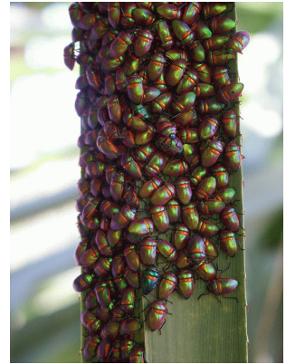
Swarming jewel beetles

“Almost straightforward to the top – but slow. Final zigzag just below the top to find the notch that took us all the way. As per the map, the ‘top’ wasn’t the TOP. We walked along a flat, then climbed, then flat, then climb, eventually reaching the real plateau. We walked on to the edge of the plateau where we had a rest. Found an animal track of some sort that took us some distance. Had another rest, not long after which we came to an area swarming with birds. Lots of small 1-2m grevilleas, some in flower, some not. Many small acacias in bloom; a few larger 4-5 m trees I didn’t recognise. It was too pleasant to miss, so we sat down