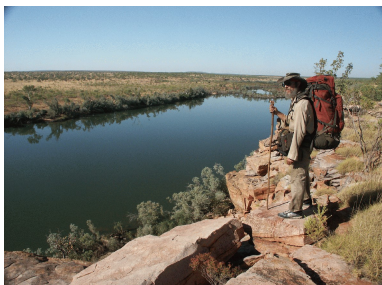
Upper Durack beyond the gorge

creek, joining it near where it dropped over a small waterfall. To here it had been easy. Dropping down was less so. We had to contour toward the downstream (north) edge and then zig zag our way down. Not too hard, but not easy either. A very short walk from where we reached the bottom brought us to some small to medium paperbarks next to a pool – good shade for lunch.”