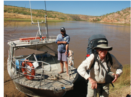
Last one out

On previous trips, we took bus to Wyndham where we took a boat to the start of the walk. We got dropped off in a tidal area but a short, reasonably easy walk from there got us to a great view point overlooking the fresh water below. Even this close to the tidal zone, we could see only freshwater crocs on previous trips and one of our big safety concerns immediately disappeared. The boat is no longer available but there is now a helicopter stationed close enough to make a helicopter drop off practical.