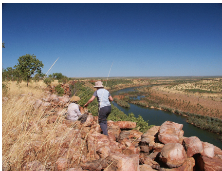
First high view of the non-tidal Durack

The best way to describe some of what follows is to quote from the notes I made at the time. "We continued on top, generally quite easy and flat, stopping for an occasional view, until we dropped down to the river level. Very rough scramble going down. We cut cross country, still mostly west until we reached the river. Round river stones were the most difficult terrain we'd encountered to this point. Very slow." Slow and strenuous – the Durack walk contains some of the most difficult terrain we traverse on any of our trips. It also contains some of the easiest – huge flat rock ledges that go on for kilometres at a time.