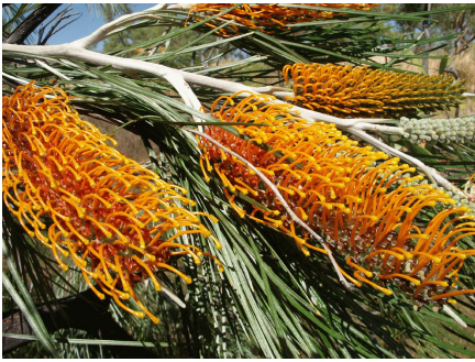
Grevillea dripping with nectar

From Nyia, we will cut across the plateau taking a short cut back to the Durack. Once again, it is worth quoting from my notes.