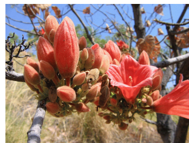
Kurrajong, this tree loses all its leaves before it flowers

Vegetation Level 2-4. Can vary from year to year depending on when last burnt. It is likely that you will spend some time pushing through some fairly thick scrub or grass. At this time of year, the spear grass has finished seeding and dried out. It may be necessary to push through thick spinifex in some places. Good variety of wildflowers.