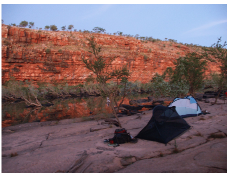
Campsite near sunset

There is a relatively short but quite interesting side gorge that we'll do without packs as a half-day walk. It's slow going but there is a bit of Aboriginal art and it finishes at a large pool that doesn't show on the map.