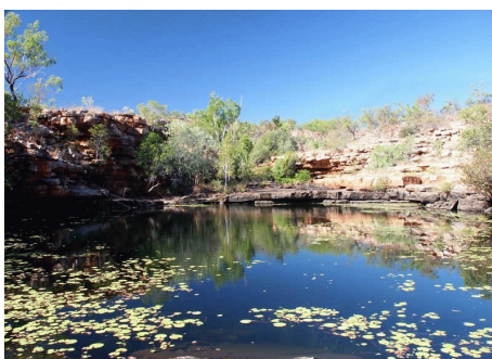
Lily pool, Nyia Creek tributary