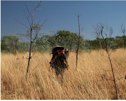
Flat, easy walking on the plateau