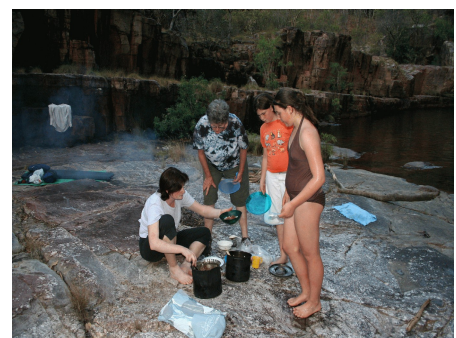
Three generations about to have dinner, first camp.

The two main gorges at Graveside contain some of the nicest monsoon forest in Kakadu. We usually spend a full day exploring the gorges, enjoying the shade and relaxing in and around the large pools below the waterfalls at the tops of the gorges. It's a bit of a scramble to get up the gorges but the large, deep pools at the top of the two gorges make it more than worth while. Swims are almost always too much to resist for any member of the family.