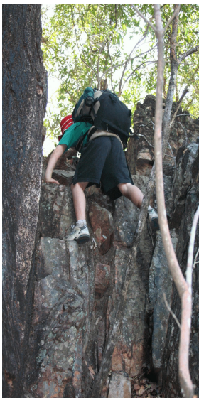
The climb out of the gorge is and looks hard, but he was only 8 and he did it unassisted.

The next day, we do a short, steep climb out of the gorge, getting some great views before we return to the two branches of the creeks for still more swims.