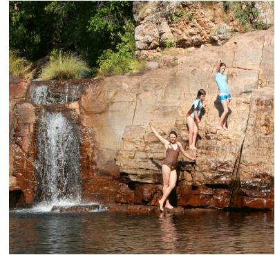
Swim at first camp

It takes you into the greatest concentration of permanently flowing creeks we have ever found in Kakadu. You see a variety of landscapes, deep gorges, beautiful swimming pools and cascades as well as a number of little known Aboriginal art sites.