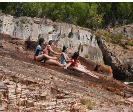
Most go down the slide one at a time. The four here decided that all together meant more fun.

The last 500 metres alone often takes two hours or more as the deep pools and a natural water slide are much too inviting to pass by in a rush.