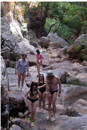
Walking up one of the shady gorges.

We begin with a four to six hour, 350 kilometre drive from Darwin. The last 45 kilometres is on a 4WD track which is so rough that it can take over two hours on its own. From the parking area, a relatively easy 4 to 5 kilometre walk across some fairly flat ground brings us to a lovely pool and our first camp site.