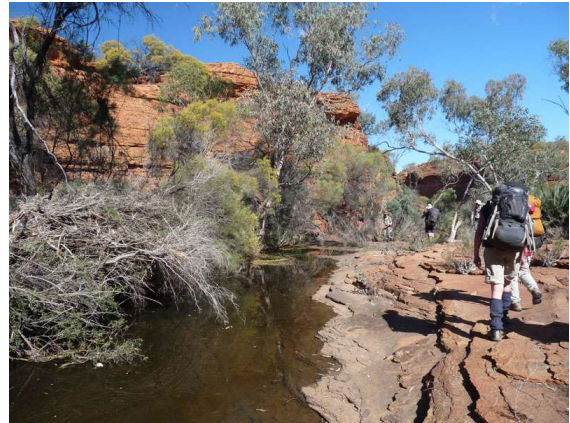
Walking along Kings Creek

Early the next morning, we drive to the Kings Canyon car park, don our packs and begin a three night walk. With luck,