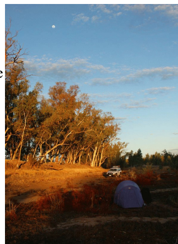
Sunset camp, Boggy Hole Track

Summary. While Palm Valley and the Boggy Hole 4WD track are the best known parts of Finke Gorge National Park, they are far from all the park has to offer. Willis's Walkabouts is the only tour operator who will take you off the tracks to places that you can only reach on foot in this park. Similarly, Watarrka is far more than Kings Canyon. You'll see the best that can be reached on a relatively short walk.