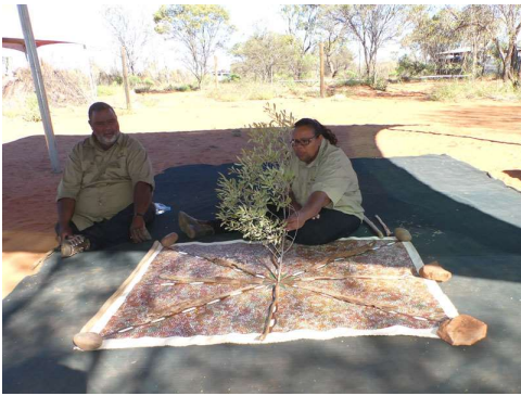
Explaining a painting on the Karrke tour

After the tour, we drive another 40 km to the Kings Canyon Resort where we spend the night in budget accommodation.