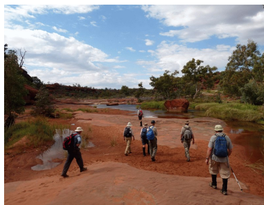
Easy walking upstream of Palm Valley

Day 12 Finish walk. Return to Alice Springs via Mereenie Loop road. Drop off at your accommodation late afternoon.