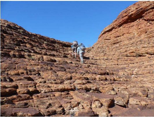
Steep climb near the start of the Giles track

we'll again get permission to leave all trails behind and get deep into the back country. If not, we'll do a car shuffle and do a slightly extended version of the official Giles Track.