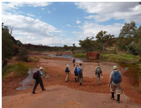
Walking above Palm Valley