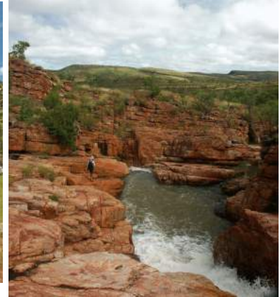
Day walk along a Packsaddle tributary.

The two photos on the near right and the one below show the same waterfall from slightly different vantage points on two different wet season trips.