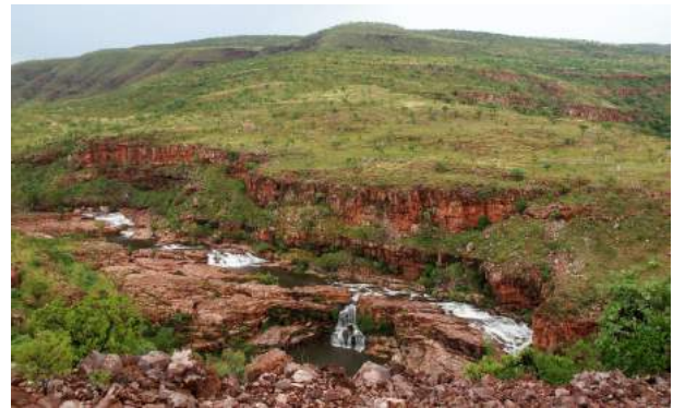
Packsaddle Falls panorama

We finish the walk on a 4WD track that comes into the base of Packsaddle Gorge. If it hasn't been very wet, our transport may be able to come all the way in for the pick up. But, if as is often the case, the road is flooded, we will have a 4-5 km walk on the track to get to the vehicle which will take us back to Kununurra.