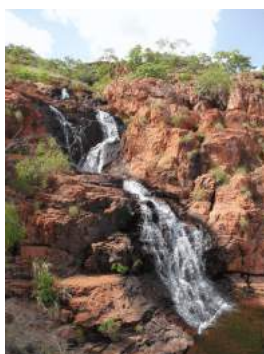
Upper falls, Middle Springs

Local people often visit places like Black Rock Falls and Middle Springs just to the west of the town. On our 2013 trip, we did our first