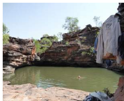
Hidden Valley swim