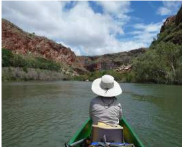
On the Ord near the start of the canoe trip

From Kununurra we are driven to Lake Argyle where we put the canoes in the river just below the main dam. The next four days are spent doing a leisurely paddle back to Kununurra, stopping to do a few day