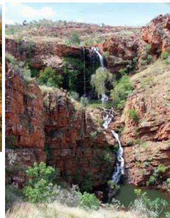
View of the central falls on the climb up.