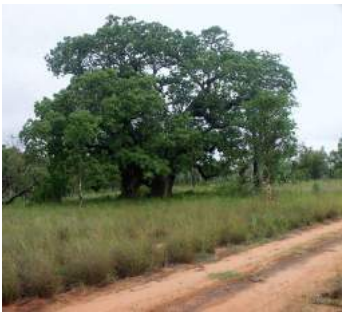
Leafy boab on the Packsaddle track.

On the final day, you can choose to fly back to Darwin or join us for the long drive. We expect to arrive in Darwin sometime after 7 pm on the last day.