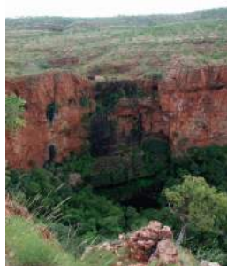
Dry waterfall – will this year be better?