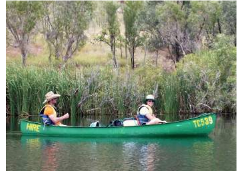
Gently paddling along one of the more open sections.

Previous canoeing experience is not necessary. If the Ord is flowing too fast below Spillway Creek, we can arrange for a larger boat to pick us up at that point.