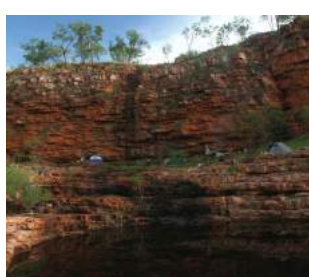
Campsite and pool above the dry waterfall.

From here we hope to do a loop over to a spectacular waterfall we found in on our May 2003 trip. When it's flowing, as it should be at this time of year, it could be the most spectacular waterfall in the range. Should be .... the last time we were there it wasn't flowing but we did get to enjoy one of the prettiest campsites on the trip.