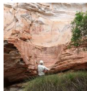
Looking at one of the Middle Creek art sites