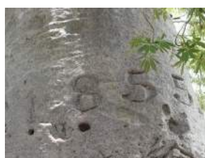
Europeans have been carving trees in Australia for a long time.

If the road is open, we'll continue our history lesson with a stop at Gregory's Tree. Augustus Gregory