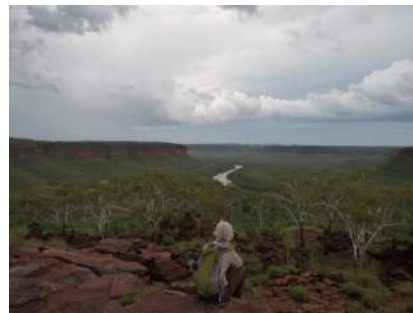
Late afternoon view from the Gregory escarpment walk

Gregory art site. This site is on a marked trail. In keeping with the wishes of the traditional owners, we do not publish photos of the sites not on tourist trails.