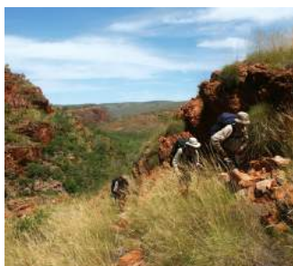
Climbing up near past the first falls.

Once at the top, we set up a base camp and spend a day exploring with only a day pack before continuing north toward Packsaddle Creek, the largest in the range.