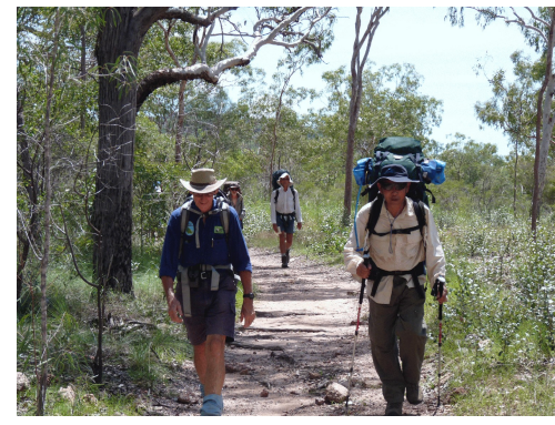
On the marked trail. This is as easy as it gets.

The rugged nature of the approaches prevented buffalo from reaching the basin, making this one of the few undisturbed areas in Kakadu. The area is full of rock shelters that were used by Aboriginal people over the millennia. It contains what may