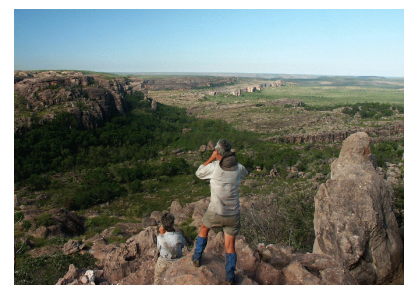
View from the high point between Barramundi and Waterfall Creeks

The morning we leave the big pool is more strenuous than most. A one kilometre walk brings us to the steepest climb of the trip—and one of the most magnificent views as we look out across the plateau and the broken rock that makes up the headwaters of Waterfall Creek. A climb down to a