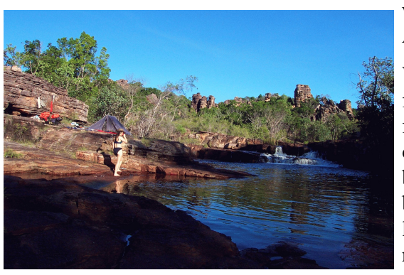
Campsite and pool.

well be the greatest concentration of Aboriginal rock art in Australia, dating from the most ancient to the most recent.