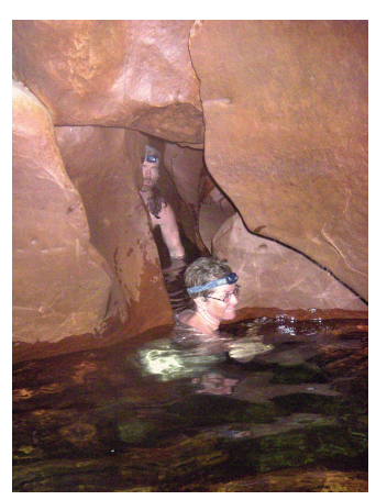
Exploring the cave.

Day 14 Return to vehicle. Drive to Darwin via Pine Creek. Drop off at your accommodation, late afternoon.