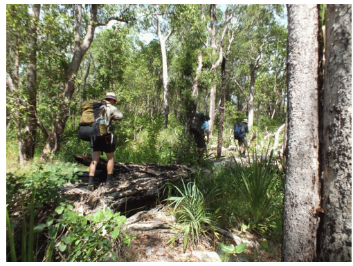
En route from Radon to Baroalba

But, before we head off the next morning, we do the 6:45 am Yellow Waters cruise. This gives you a good view of the Kakadu wetlands, not the best place for a bushwalk, but a wonderful place for birds and other wildlife.