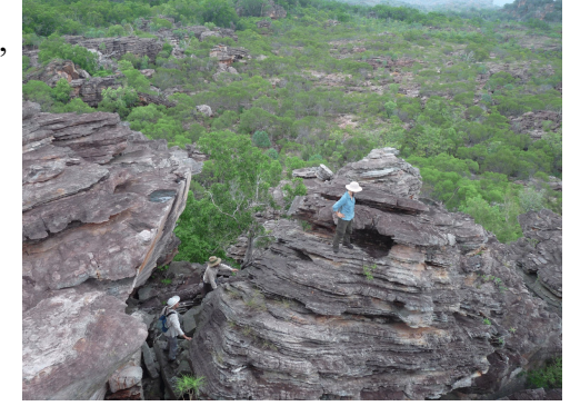
Climbing to a high point for a view.

The next few days are spent slowly working our way upstream, exploring the many wonderful rock shelters, art sites and pools. Sunrise and sunset from the Baroalba high points are among the nicest views in Kakadu. We may decide to carry water up and spend a night camped on a high point. About nine kilometres above Baroalba Springs, we move into territory untouched on any of our other trips as we move toward the headwaters of the main branch of Baroalba Creek. A couple of kilometres over a gentle pass brings us to Radon Creek, the largest in the northern part of the massif. Radon Gorge is steep, narrow, cool and beautiful. Some parts are