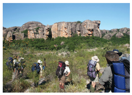
Looking back, halfway down to the Waterfall Creek plateau

small rocky plateau brings us to a creek where nature has created a place which a number of people have said is their favourite in all Kakadu. We take our time so that we can fully appreciate this location.