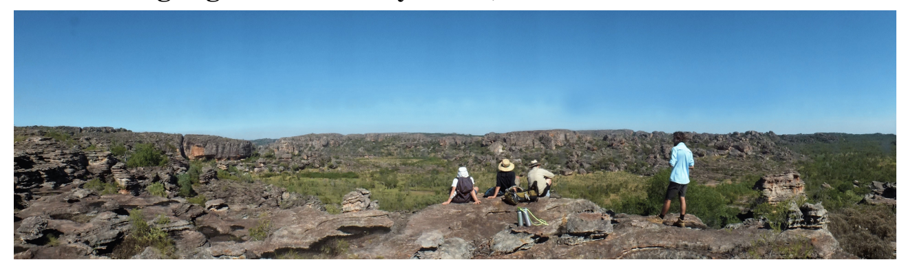
List price - $2695 For information about our advance purchase and other discounts, see our discount page, <a href="https://www.bushwalkingholidays.com.au/discounts">www.bushwalkingholidays.com.au/discounts</a>

Summary. Section 1, list price $1795, takes you into the greatest concentration of Aboriginal rock art we can visit in Kakadu. Good swimming, great views and amazing rock formations. Section 2, list price $1895, takes you to some great waterfalls and Aboriginal rock art sites. More great views, great campsites and an amazing swim through cave.