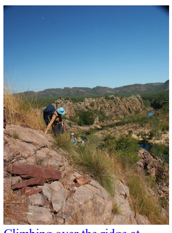
Climbing over the ridge at Koolpin

If the 4WD track to Koolpin Gorge is closed (still possible at this time of year), we begin with a relatively flat eight kilometre walk from Flying Fox Crossing to the main camp ground which we will have to ourselves. If the track is open, we can drive all the way in and begin our walk up the gorge. (If we do drive in, the guide will drive the vehicle back out to the main road and walk back to the gorge.)