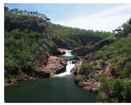
First two waterfalls at Koolpin

This walk is intended to be run at a slightly faster pace than section one. This should still, allow plenty of time for swimming and relaxation. A fast group could cover more ground and explore a few additional places. There is even the possibility of some people having a relaxing afternoon by a pool while the guide leads the others on an exploration of the surrounding area.