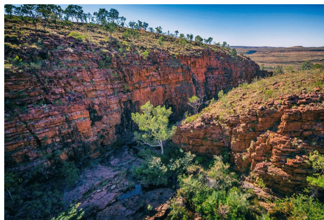
Lost City Area

We plan to begin by walking up El Questro Gorge toward an area they call the Lost City.