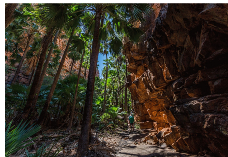
El Questro Gorge

We had hoped to do this section into the Cockburn Range as we had done for many years prior to a successful native title claim. The traditional owners of the area decided that they didn't want us walking in the area but did not say why. While the claim was for non-exclusive title, it does allow them to prohibit commercial operators. Rather than do a short walk above Emma Gorge and a longer one on El Questro, we decided to replace the Cockburns entirely and do a longer El Questro walk recommended by a former guide who lives in Kununurra.