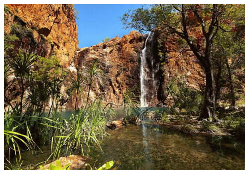
Miri Miri Falls

We return to the main part of the property, collect our vehicles and drive back to Kununurra.