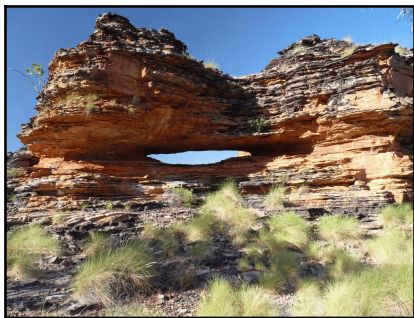
Keep contains more rock arches than anywhere else we walk.

For most of the year, much of the park is nearly a desert. The palms and boabs which add to the interest of the area are adapted to a climate in which rain is unlikely for six to eight months at a time. Water is scarce and restricted to a few permanent waterholes. We know where these are and will base our walks around them.