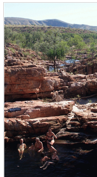
Swim stop above one of the many Carr Boyd waterfalls.