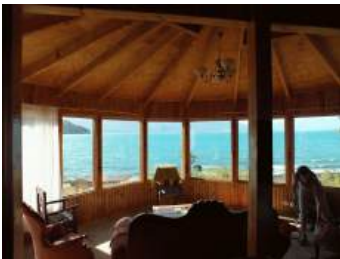
Lounge room in Puerto Guadal