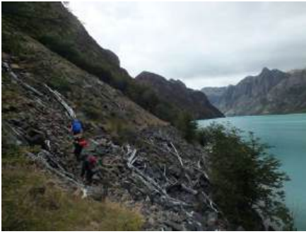
Nearing the northern end of the trek