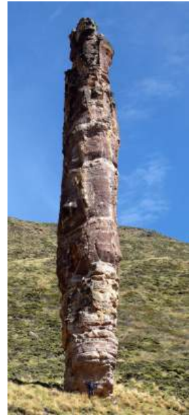
Needle rock, northern Parque Patagonia. Look closely and you can see a person at the base.

Puerto Guadal, is a small town with some impressive accommodation with views over the second largest lake in South America. We will certainly look out for opportunities such as these.