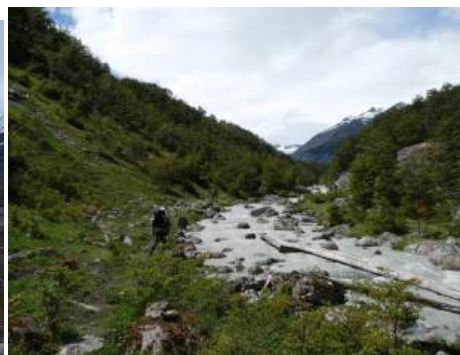
Heading up the Mosco valley

Leaving Villa O'Higgins, we will take a boat to Candelario Mancilla to undertake the O'Higgins Glacier trek (Boat and weather dependent), returning to Candelario Mancilla and staying overnight at Villa O'Higgins.