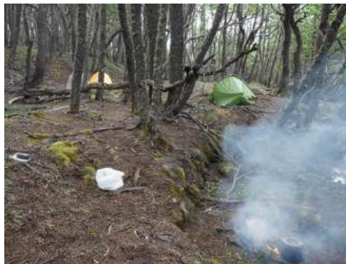
Sheltered forest campsite next to a stream

The climb wasn't particularly difficult. We found a nice, sheltered campsite not long after lunch. Those who were feeling