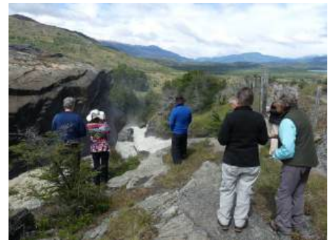
Baker River Rapids day walk

There is no other tour like this on the travel market. Instead of a fixed itinerary, there is a general outline and a rough indication of how much time each section will take. If one area turns out to be especially good, we have the flexibility to spend extra time there. Transport during the trip will be primarily rental cars and, of course, your own feet. On one overnight walk, you may be able to pay for a horse to carry your pack for you. The rest of the time, you will need to be prepared to carry everything you need.