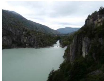
Baker River gorge and rapids

Our next section, centres around Villa O'Higgins, the end of the Carretera Austral. In this area, options include a Tigre Glacier walk and a 2 day base camp hike up the Rio Mosco River. A visit to Caleta Tortel, an amazing village on stilts, as a side trip on the journey down, is also a possibility.