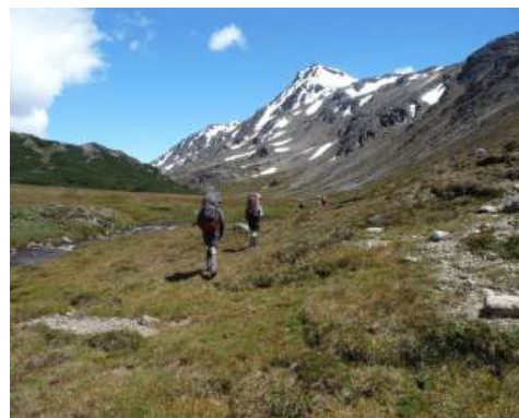
Walking on the main plateau.