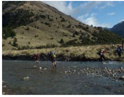
One of many river crossings