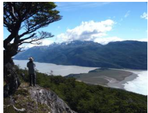
View from the top before the big descent.

From the viewpoint shown in the photo at right above, we had a descent of 700 metres. We camped near a small farm at the bottom that night. The next morning, we walked to the river on the far side of the photo, got a boat across and climbed the hill you can see in the background.