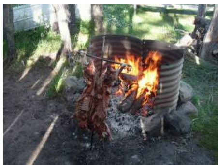
Lamb on the spit

two show Mount San Lorenzo. The one at right shows how the wind has stirred up a huge dust cloud going something like two kilometres into the sky. There are options here to stay at the base camp and do day walks or we can complete the overnight stay at the hut. This will be weather dependent.