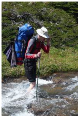
The short wade

Given the wind on what we were later told was a relatively calm day, we'll try and make it all the way across.