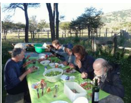
Enjoying the Patagonian banquet.

The two photos at left show the traditional Patagonian banquet we enjoyed on the last three trips. Fresh salad, local potatoes, a special Patagonian bread and some wine to go with the lamb made for a real feast.