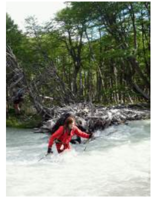
Fording the river

The big one. Don't believe the maps? The southern icefield walk was and is a great walk but the best maps available when we last did it left something to be desired. The trek began with a bit of a slog along a gravel road to a nice campsite with a good view down toward Mount Fitzroy. Nice spot, but it meant that we had an interesting wade across the Obstáculo river the next morning – flowing fast, waist deep through icy water. It's not described in the track notes, but it should be possible to avoid the wade by crossing a bridge much further downstream and following the river up to join the walking trail.