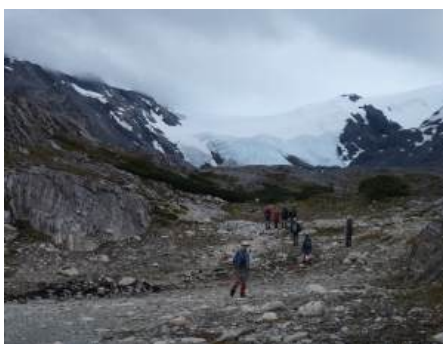
Approaching the Tigre glacier