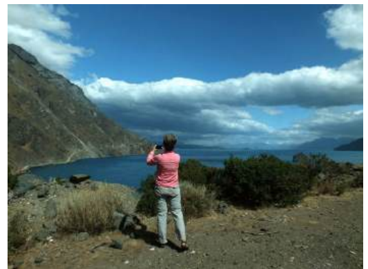
View stop on the road between Puerto Guadal and Chile Chico.

20 km return walk. Side trip with guides only (across private land) to the Leones Glacier. Includes a boat trip on Lago Leones to the glacier face and a spectacular lunch One of our guides did this in January 2025. Highly recommended. It is a full day so consideration will be to be given to camping that night.