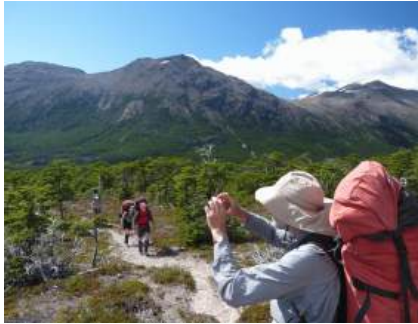
On the climb

From here, it's a long climb to the plateau above. Eventually it levels out and you have another small creek crossing – no avoiding this one. Once on the top, the terrain is gently undulating and easy going. There were a few potential campsites but camping on top isn't recommended because of the wind coming off the southern ice cap.