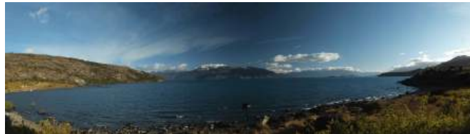
View from the lounge shown at left. Lake General Carrera, the second largest lake in South America.

The road between Puerto Guadal and Chile Chico, a small town on the Argentine border is one of the most spectacular drives we do. The line near the edge of the lake in the photo is the road.