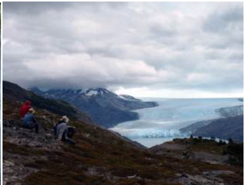
O'Higgins glacier from just above the camp

energetic did an afternoon walk past the 'official' campsite to another viewpoint. They said we'd picked the best spot. As it was light until nearly 11 pm, there was no problem getting back in daylight. We'll probably do the same on this trip as the loop walk shown in the track notes is rated as much more difficult and harder to follow.