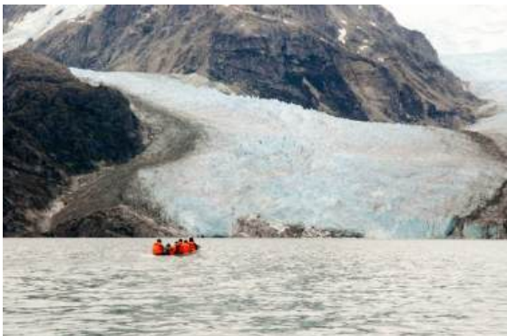
Lake Leones and Leones Glacier