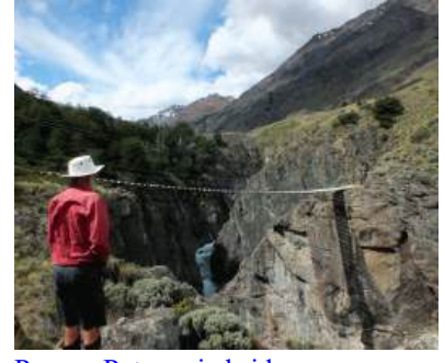
Parque Patagonia bridge

This area is vast but it is our plan to move north from Cochrane toward Parque Patagonia. Here, we plan a 4 or 5 day through walk, taking in the best of this astonishing park which can include indigenous cave paintings by dividing into 2 groups with a vehicle at each end, meeting midway and culminating by regrouping in Chile Chico or Puerto Guadal. The three photos above were taken on one of our earlier through walks. If time permits, we may include a day walk to ‘Needle Rock’ in the northern part of the park.