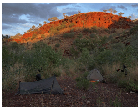
Sunset, Munjina camp

Our local transport picks us up from our accommodation in Tom Price for a drive of about 150 kilometres to the edge of Karijini National Park where we begin a one week walk combining the Munjina and Dales-Dignam gorge systems.