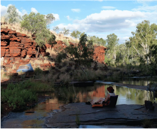
Knox Gorge campsite

Kalamina is one of the most underrated gorges in the park. If time permits, we will spend two nights at our Kalamina campsite and do a day walk exploring further down the gorge. We then follow one of Kalamina's tributaries past a major art site up onto the plateau and head across to the headwaters of Knox Creek and downstream to a secluded camp at the very head of Knox Gorge.