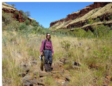
In the spinifex

Spinifex. The original trip notes said, "The vegetation can vary dramatically from year to year. If, as is likely, we have to walk through unburnt spinifex, you will need heavy duty gaiters as the spinifex easily penetrates long trousers and lightweight gaiters." Some groups have had bad spinifex. The guide on one of those trips stressed that people were not adequately prepared. He recommended leather gloves in addition to long pants, gaiters and leather boots. It isn't as bad on some trips. We can't know in advance but we do know there will always be some bad patches. Some people prefer shorts in spite of the scratches. Most people prefer the protection.