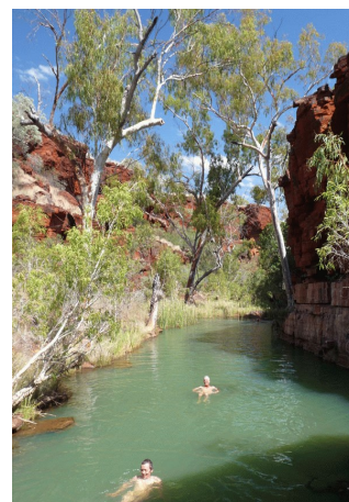
Munjina swim, less than two hours from the start.