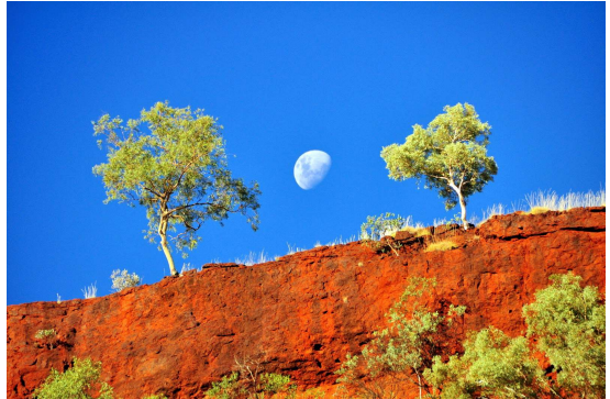
Moonset over Karijini cliff