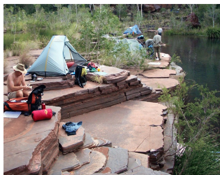
Dales Gorge campsite

We leave the Munjina system and climb onto the plateau for a fairly level walk across to a tributary of Dales Gorge. There are some amazing pools here, but the descent into the side gorge is very steep and must be done slowly. Our campsites in Dales will be determined by how fast we are going and the state of the pools at the time.