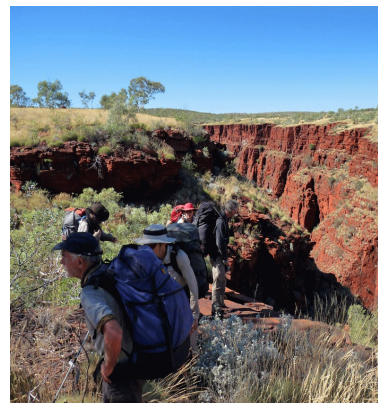
Above Red Gorge on our last day.

The best? The best is, of course, a matter of opinion. The average daytime maximum temperature is 33°C as compared to 24°C in June or July. On the other hand, the average nighttime minimum is 21°C with an all time record low of 9°C in April as compared with an average of 11°C and a record low of 1°C in June. In April, you should be able to leave your sleeping bag at home.