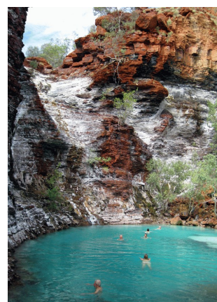
Swimming at the blue pool.

Dales Creek flows through a large gorge. It is fed by a number of small creeks, many of which have their own gorges, each with its own character. Dignam is by far the largest of these. Some groups have spent little time in Dignam; others have spent a full day. We are still exploring and hope to camp well up the gorge on this or some future trip. There are other potentially interesting side gorges which we may explore as well as or instead of Dignam.