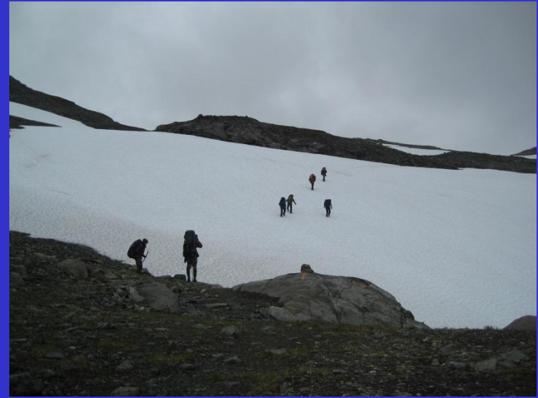
Border crossing between Sweden and Norway, climbing snow patches, and discovering the wonderful Norwegian mountain huts