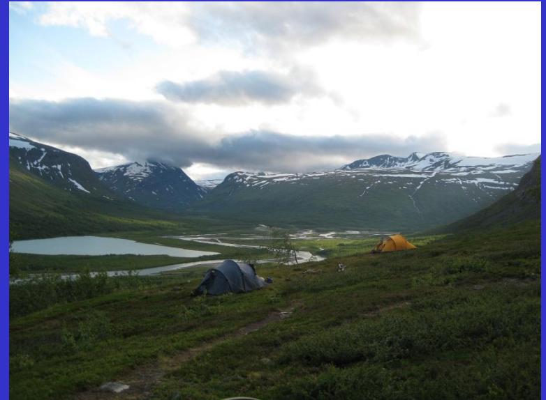
River crossings, mountain campsites and Swedish massage