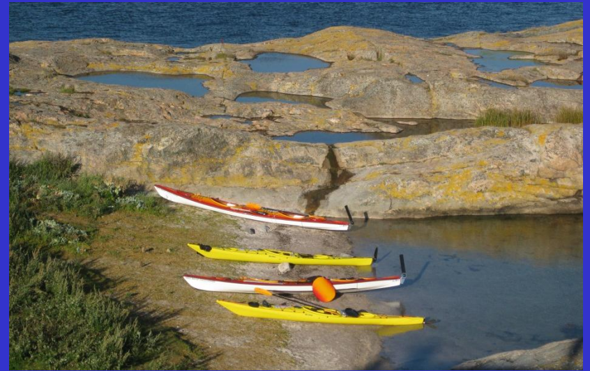
Sea-kayak trip near Grebbestad, Sweden