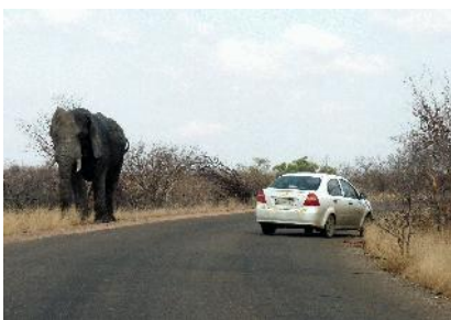
When you are driving in Kruger, the locals have right of way.

We will try and book one of the four day Kruger Wilderness Trails, (see www.sanparks.org/parks/kruger/tourism/activities/wilderness/ ) and combine it with two or three nights in one or two large camps and one or two small ones.