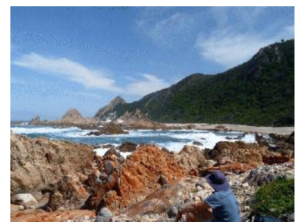
Enjoying the view before the final climb on the Harkerville Trail

It's a long drive from De Hoop to Knysna, our base for this section where we'll do part of the Outeniqua Trail plus the Harkerville Trail, one of the most spectacular coastal trails in South Africa. Walkabouts owner Russell Willis has done the Harkerville four times and would be more than happy to do it again. It's not easy,