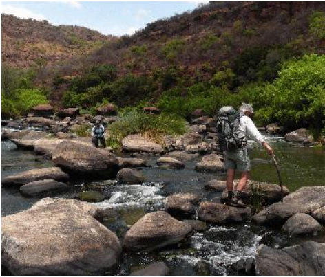
River crossing on the Kingdom Trail

This last hike gives you more good views, a final chance to see African wildlife, comfortable beds and a few river crossings. Sometimes we can do them with dry feet. Sometimes, as at left, it requires a wade.