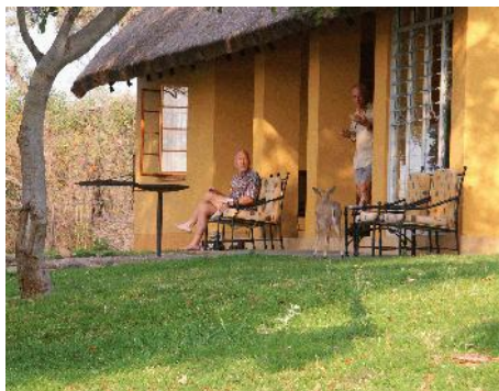
Shimuwini accomodation & visitor