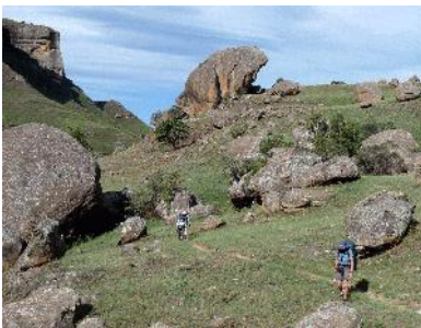
On the trail to Gxalingwa