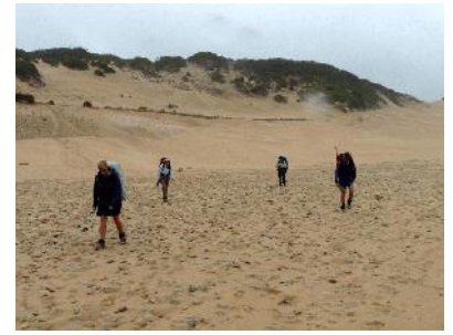
Walking along the beach near the start of the Alexandria Trail.

For more information on the trail see the Footprint Hiking Club Alexandria Trail page, www.footprint.co.za/alexandria.htm , and/ or the South African Hikes website Alexandria page www.sahikes.co.za/Details.asp?TrailID=4 We hope to put up an Alexandria album in the not too distant future.