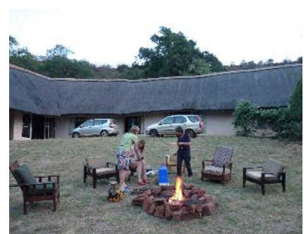
Final dinner at the end of the last walk

We'll finish with an old favourite, run by Anvie Ventures, the Olifants Gorge Trail (I've already done it four times.) See http://www.anvieventures.co.za and click on "Overnight Trails and Backpacking" on the left menu. The first and last nights are spent at a wonderful old farmhouse.