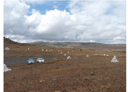
Isandlwana – every pile of stones represents where a small group of British soldiers fell in battle.

Rorke's Drift stands famous in British history. Not so famous is the disaster the British had as nearby Isandlwana. Visiting a few historical sites added an extra dimension to previous trips so we'll do it again. It's one of the best chances we have of getting a bit of a feel for the local culture. In 2008 and 2010, we included a full day tour with a local history buff. It was so good that we'll try and include it again. Alternatively, we might visit some of the Battlefields from the Boer War or, if people are very interested, we might even do both.