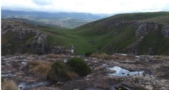
High view, lunch time, day 1, Woodcliffe Trail

As is the case with many South African Trails, the Woodcliffe Trail is privately owned and operated. Their website www.woodcliffecavetrails.co.za/index.html explains just what they have to offer.