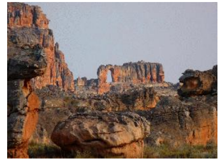
Wolfberg Arch, Cedarberg. This is on the long day walk.

http://www.cederberg.co.za/sanddrif.html