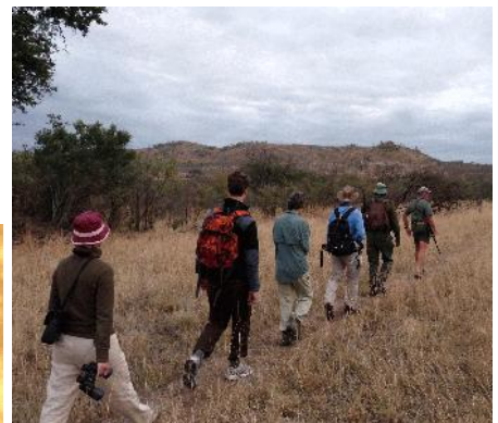
Two armed guides accompany us on our Kruger walks

We'll definitely try and include Shimuwini, my favourite camp in the park. A short walk from our front door brings us to a bird hide and views out over the river below.