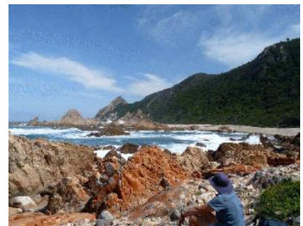
Enjoying the view before the final climb on the Harkerville Trail

It's a long drive from De Hoop to Knysna, our base for this section where we'll do part of the Outeniqua Trail plus the Harkerville Trail, one of the most spectacular coastal trails in South Africa. Walkabouts owner Russell Willis has done the Harkerville four times and would be more than happy to do it again. It's not easy,