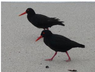
Black oyster catchers

Worcester. We've been there on two previous trips and enjoyed it both times. For more on the gardens see www.sanbi.org/gardens/karoo-desert .