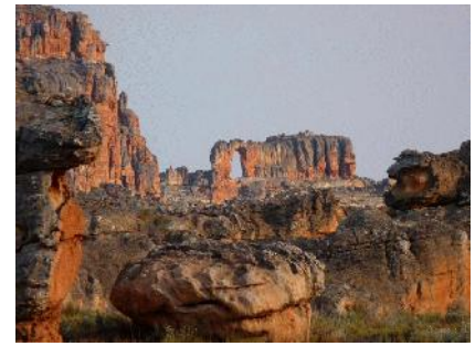
Wolfberg Arch, Cedarberg. This is on the long day walk.

http://www.cederberg.co.za/sanddrif.html