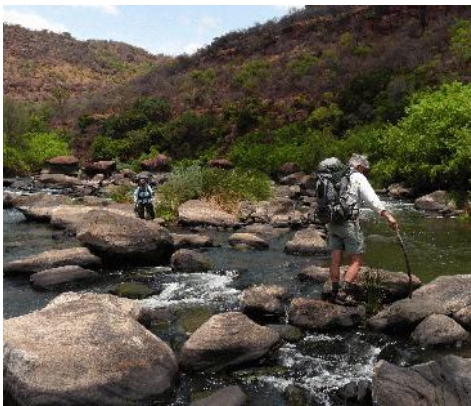
River crossing on the Kingdom Trail

We'll finish with an old favourite, run by Anvie Ventures, the Olifants Gorge Trail (I've already done it four times.) See http://www.anvieventures.co.za and click on "Overnight Trails and Backpacking" on the left menu. The first and last nights are spent at a wonderful old farmhouse.