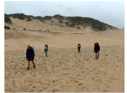
Walking along the beach near the start of the Alexandria Trail.

For more information on the trail see the Footprint Hiking Club Alexandria Trail page, www.footprint.co.za/alexandria.htm , and/ or the South African National Parks page, https://www.sanparks.org/parks/addo/tourism/activities/alexandria_trail.php