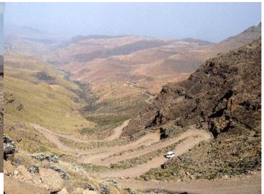
The Sani Pass road into Lesotho.