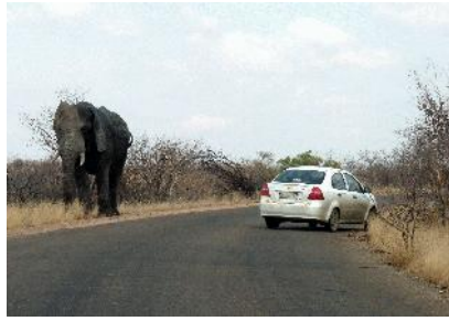
When you are driving in Kruger, the locals have right of way.

We will try and book one of the four day Kruger Wilderness Trails, (see www.sanparks.org/parks/kruger/tourism/activities/wilderness/ ) and combine it with two or three nights in one or two large camps and one or two small ones.