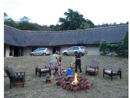
Final dinner at the end of the last walk

This last hike gives you more good views, a final chance to see African wildlife, comfortable beds and a few river crossings. Sometimes we can do them with dry feet.