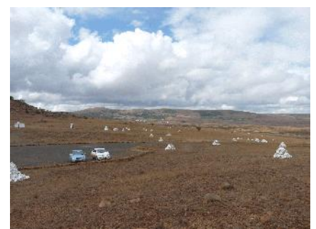
Isandlwana – every pile of stones represents where a small group of British soldiers fell in battle.

We'll spend two nights at the Penny Farthing B&B and do one of their Battlefields tours. I've done two before and can recommend them. See www.pennyf.co.za