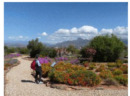
Karoo Botanic Gardens

Russell wanted to do it on his last trip but wasn't able to book. Recent bushfires have done some damage so we'll aim to do a three or four day option instead of the full trail. It's quite a way from the Cedarberg, so we'll spend most of the first day driving. Most, not all. Along the way we plan to stop at the Karoo Botanic Gardens in