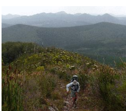
Misty morning on the Outeniqua Trail

It's a long drive from De Hoop to Knysna, our base for this section where we'll do part of the Outeniqua Trail plus the Harkerville Trail, one of the most spectacular coastal trails in South Africa. Walkabouts owner Russell Willis has done the Harkerville four times and would be more than happy to do it again. It's not easy,