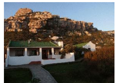
Olifantsbos sunset, your nearest neighbour is 20 km away

For more information about Olifantsbos see http://www.sanparks.org/parks/table_mountain/tourism/availability_dates.php?id=410&resort=39