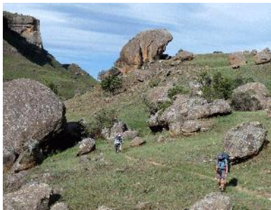
On the trail to Gxalingwa