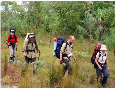
Walking through open woodland.

Jim Jim Falls is the highest in Kakadu, 200 metres overall with a final sheer drop of 160 metres. The view from the top is spectacular.