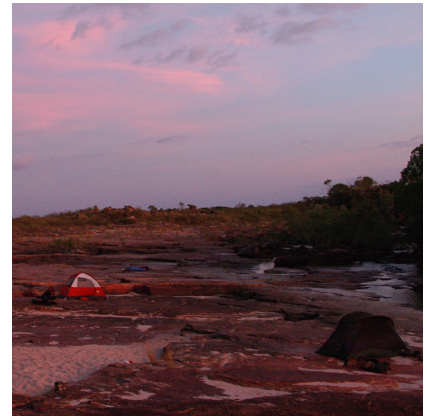
Jim Jim campsite above the falls, sunset.

These notes describe the trip in an anti-clockwise direction. Some groups do the walk in the opposite direction. Your guide will let you know which way you will be going at the pre-trip meeting.