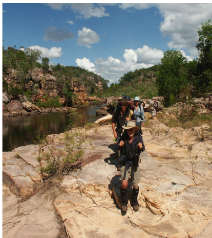
Walking along upper Twin Falls Gorge.

If we arrive early enough, it may be possible to take a boat up the gorge and visit the base of the falls with an Aboriginal guide. There will be an extra charge for this.