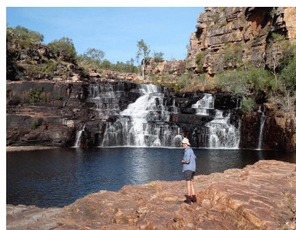
Getting ready for a swim at Amphitheatre Falls.

After a look around the top of Twin Falls, we put on our packs and leave all signs of civilisation behind as we make our way upstream, exploring and enjoying the shady rock ledges, sandy beaches and cool pools that we find in the seven kilometre long upper gorge which ends at the beautiful Amphitheatre Falls. An abundance of good campsites means that we can stop