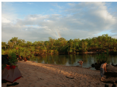
Upper Twin Falls Creek campsite, dawn.

Another six or seven kilometres up the creek brings us to an area where there is an incredible concentration of Aboriginal art sites. We visit some of these — to visit them all would take several days.