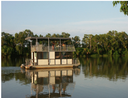
Mary River Houseboat

We cruise slowly along the Mary, watching the hundreds of birds that line the river banks and enjoying the changing scenery around us. Those who wish to try their hand at catching a barramundi have a chance to do so. We pull in to shore for the night and enjoy a relaxing final meal in the bush as we listen to the night sounds around us. The following morning, we cruise back to where we began and get into the vehicles for the drive back to Darwin. The trip is over, but the memories will linger on.