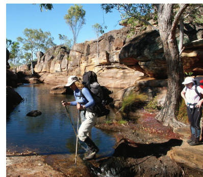
Crossing a small creek, upper Jim Jim.

And, of course, there are the swims. Every day we find beautiful pools that seem to demand we stop for yet another dip. From Twin Falls Creek, we cross over to the upper reaches of Jim Jim