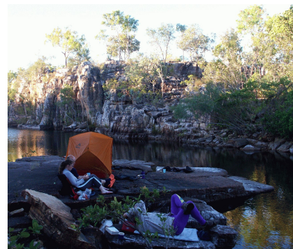
Upper Jim Jim campsite. Yet one more pool we have all to ourselves.

As we travel, we notice dramatic changes in the landscape. Small and scrubby vegetation in one location, towering paperbarks in another. Flat plains here and rocky outcrops of all shapes and sizes there. Many of the outcrops hide major Aboriginal art sites. Some shelters contain only a few paintings, others contain dozens. No group can possibly visit them all but all groups visit a good selection.